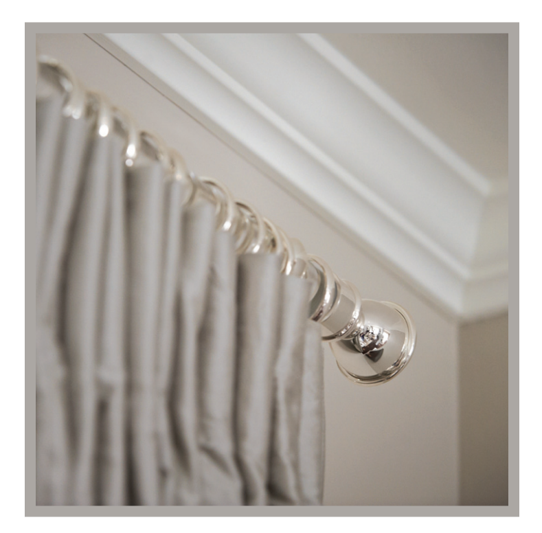
finial: FNM9124, bracket: BRM9133, rings: RIM9135 / finish: 92J5575PS rod: RDA9067 / finish: 91J5575AC fabric: SAMURAI 95J3591